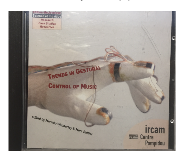
Figure 3: Cover of the electronic book Trends in Gestural Control of Music, one of the early works dedicated to musical interfaces, released in 2000.

Another early comprehensive overview of NIME-related topics is Trends in Gestural Control of Music (TGCM) [113], an e-book devoted to research on musical interfaces. TGCM, cf. Fig. 3, was one of the references cited in the proposal for the CHI 2001 workshop on NIME [81].