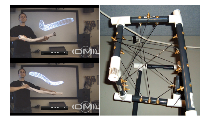
Figure 3: Left: live visualization of the Spine shape and orientation; right: the prototype sensor-harp.