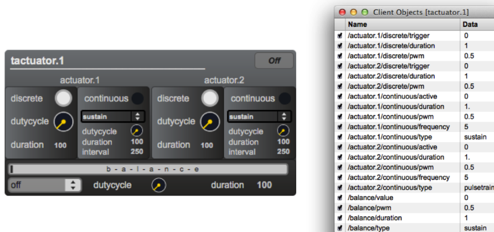
Fig. 3: The graphical user interface of the tactile notification module (left), and the pattr clientwindow showing its namespace (right).