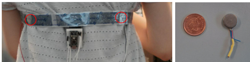
Fig. 2: On the left, a prototyping version of the display worn by one of the users, red circles mark the position of the actuators attached to the velcro band. On the right, one of the actuators used for the display.

The two vibrating disks (rotating eccentric masses) were driven using the PWM output from an Arduino Nano board. The positioning of the actuators was determined in several testing sessions with the performers involved in the project. The disks were attached to a Velcro® band which can be securely worn around the chest. In this configuration, the actuators would be in constant and firm contact with two points on the back symmetrical about the spine, with sufficient distance between them to discriminate left vs. right side stimuli [8]. The display was judged unobtrusive, and the stimuli were very easily detectable even at low intensities.