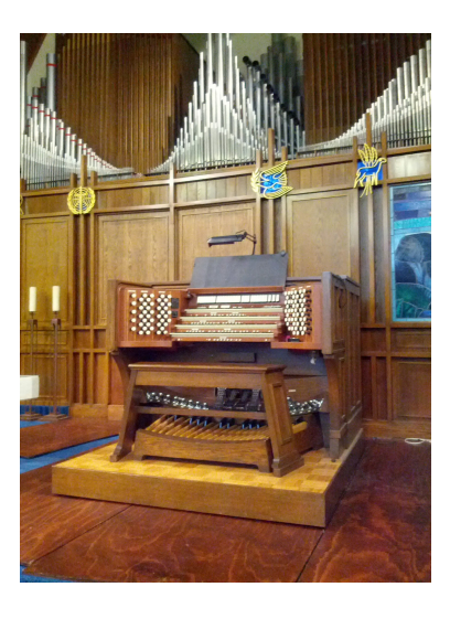
Figure 1. The Organ at Ryerson United Church.

used to control various settings of the instrument. The MIDI output port of the console will emit messages pertaining to keyboard and pedal action using note messages, as well as system changes representing the state of the couplers and stops via System Exclusive (SysEx) commands. The MIDI input provides reciprocal features of the output and allows note and system state control from external sources using the same protocol.